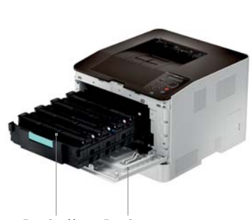
Toner Cartridge Front Cover (Color : 8,000 pages Mono : 5,000 pages)